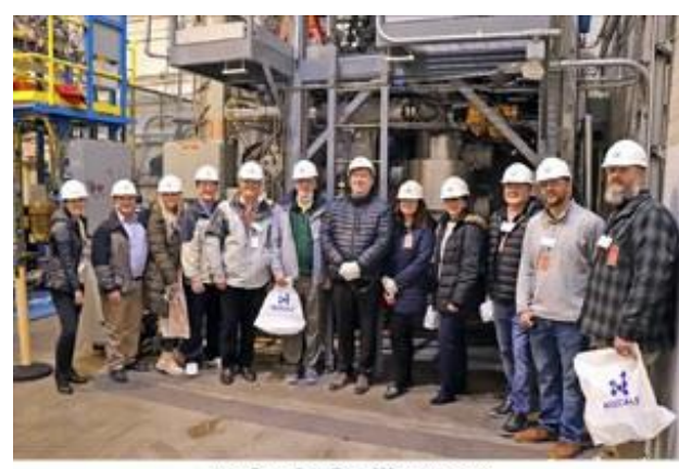
NuScale facility tour

NuScale Facility Tour. In January, UAMPS sponsored a tour of the NuScale's research and development facility in Corvallis, Oregon. Participants included new UAMPS member representatives, city council members and Northwest utilities interested in the project. Attendees learned about the NuScale Power Module, which will power the CFPP, its safety features and ability to follow load. Attendees toured the NuScale